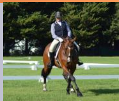
Pictures from Last Years Show.. Official EA & HRCAY Classes At the Lucindale Show